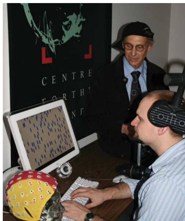
Figure 1. TMS set-up for the numerosity experiment.

We argue that the estimation of number by normal people is performed on information after it has been processed into meaningful patterns. The meaning we